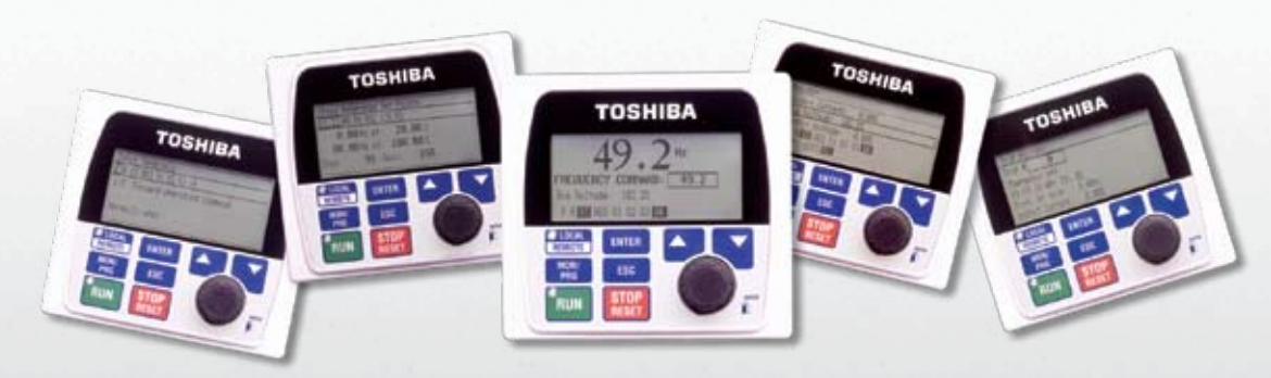
Standard Keypad Design for Low Voltage and Medium Voltage Drives