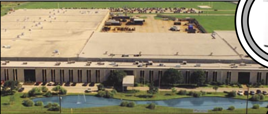
North America Headquarters & Manufacturing Facilities (Houston, TX)